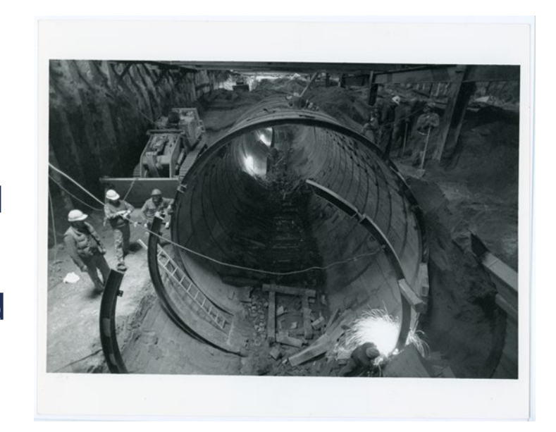
Launch Tube of Boring Machine, Pioneer Station, 1980s